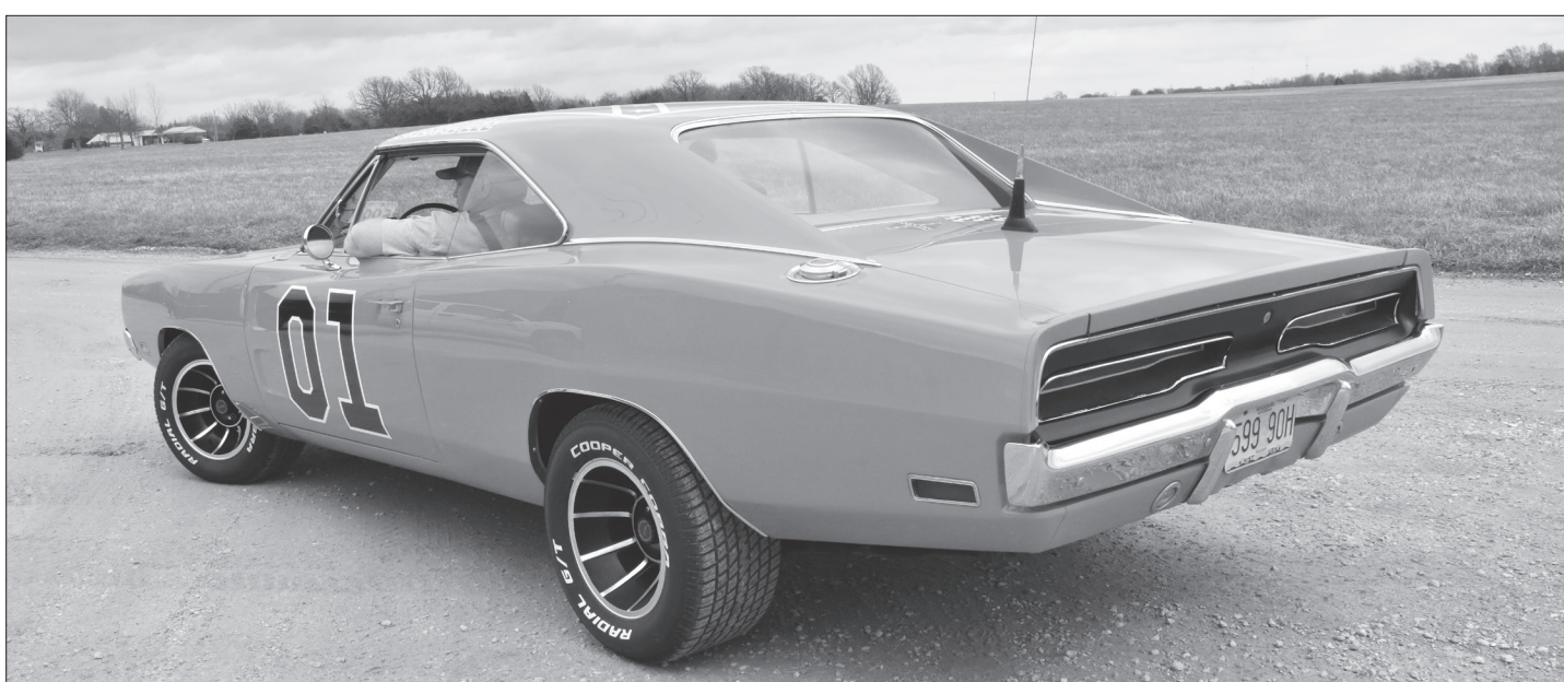
Charger • from page 13

up truck. His dad wouldn't let him drive the car, so it stayed parked in the barn.